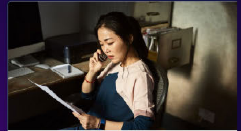
Suicidal caller guide